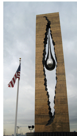
The "Teardrop" Memorial for victims of September 11, 2001 located in Bayonne, NJ